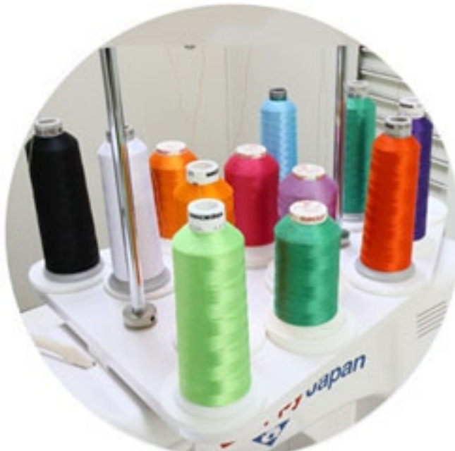
Improved stand handles more thread brands