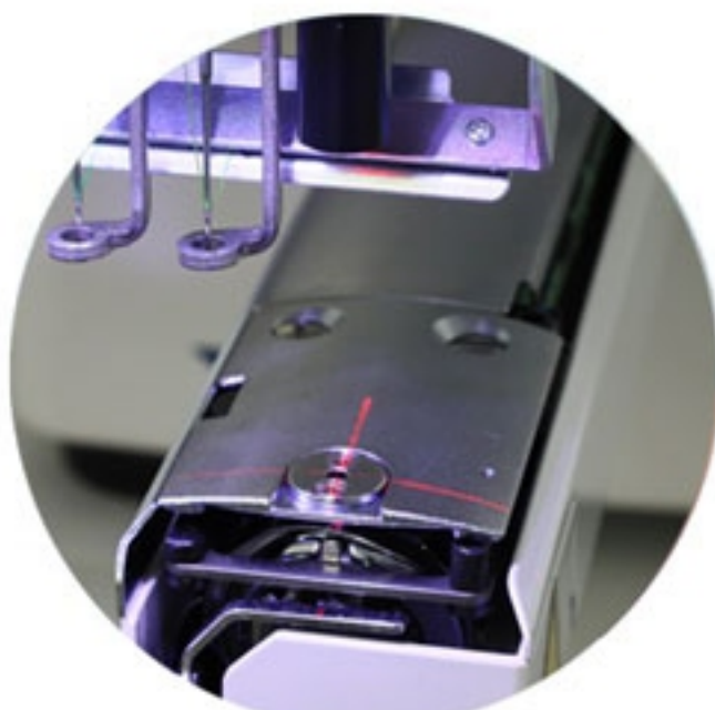
Laser position marker