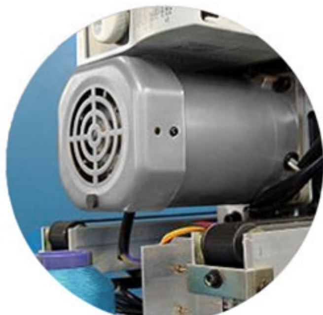
Heavy-duty motor & drive system

The 12-needle Voyager from HappyJapan delivers capabilities found on no other machine at this size: a true commercial-duty motor & drive system for higher sustained production, large continuous sew field, true wide-field cap sewing capability, and an unrestricted sewing arm to accommodate very large items. The newest-generation HCS3 introduces a vastly improved sewing head that's more robust and easier to thread, ultra-slim profile sewing arm, improved thread stand, and many other refinements. All this coupled with Voyager's renowned durability, reliability, and user-friendliness makes it a favorite for embroidery operations of all types and sizes.