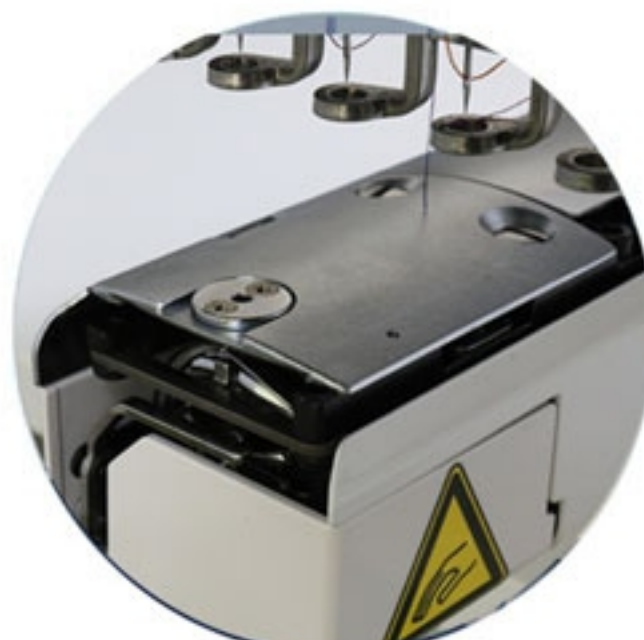
Slim profile sewing arm handles tight sewing areas